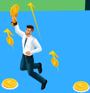
Scalability (aka Market)